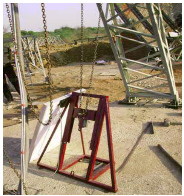
Fig: 3. Automatic tracking Stand for small Scheffler reflector

bending (like near the focus) and stiffer where less bending is appropriate (the areas far from the focus).