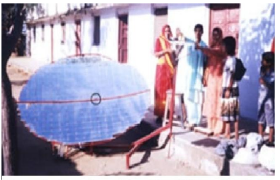
Manual changing of length of the reflector's rear support for seasonal adjustment

The power output varies with the season (Fig: 2). The Sun which shines more from the front into the reflector sees a larger reflector (large aperture), and thus more power is collected. In the same way, a sun shining more from behind sees a smaller reflector and less power is collected. A 2.7 m<sup>2</sup> reflector can typically bring 1.2 lts of water to boiling point within 10 minutes. The circle (see figure 5) at the center highlights the position of the lever for the seasonal shape change.