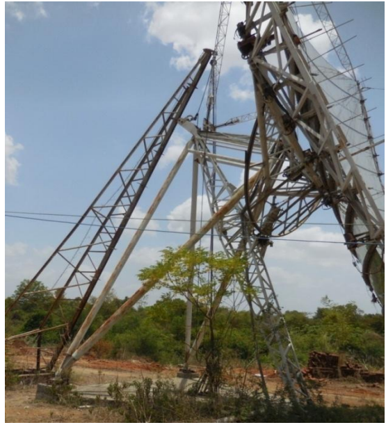
Fig: 4. Crematorium tracking stand aligned with back crane and reflector frame

The power output varies with the season (Fig: 2). The Sun which shines more from the front into the reflector sees a larger reflector (large aperture), and thus more power is collected. In the same way, a sun shining more from behind sees a smaller reflector and less power is collected. A 2.7 m<sup>2</sup> reflector can typically bring 1.2 lts of water to boiling point within 10 minutes. The circle (see figure 5) at the center highlights the position of the lever for the seasonal shape change.